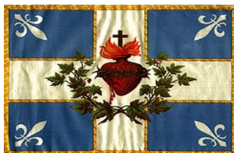
Drapeau Carillon Sacré-Coeur : A Carillon flag waved by people on Saint-Jean-Baptiste Day from its creation in 1902 until 1948. The current Flag of Quebec is based on this design, and was adopted in 1948.

Information received by http://en.wikipedia.org